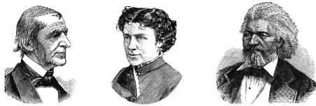
Ralph Waldo Emerson, Anna E. Dickinson, Frederick Douglass

In the conservative city of 19 th -century New Haven, the library served as a rare sanctuary for advocates of women's suffrage and the abolition of slavery. It offered classes, debates, and a popular lecture series that attracted such leading American social thinkers as Henry Ward Beecher, Ralph Waldo Emerson, Anna E. Dickinson, and Frederick Douglass.