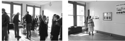
Upstairs art gallery opening, 2014

Today we run many programs, including Listen Here, a literary theater program co-presented with the New Haven Review; the Poetry Institute, a collective who invites regional published and performing poets monthly amidst an open mic session; Story Sharing, a program co-facilitated with the CT Storytelling Center that perfect techniques in sharing stories of personal experience, folklore, suspense, local history and more; and contemporary art exhibits in our gallery focused on words, language, collections, and archives.