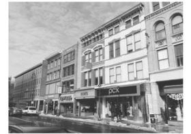
Our events space and street view at 847 Chapel Street